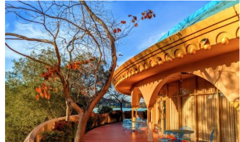
The Marin Center by Designed Frank Lloyd Wright