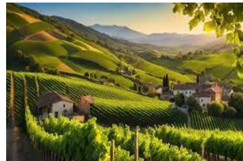
Sonoma Wine Country