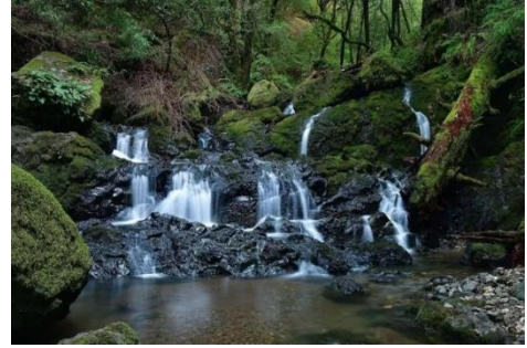
Water Fall Hike on Marin's Mt. Tamalpais

8. Art and Music. Since the 1950s and '60s, Marin has been the home and haunt of many fine artists and musicians. An art colony is centered in the Marinship-houseboat area of Sausalito, the villages of West Marin, and, more recently, in the Hamilton center of Novato. Fine music venues are proliferating in Mill Valley (the Sweetwater Music Hall, 142 Throckmorton Theater), Fairfax (The Sleeping Lady Cafe), and San Rafael (Terrapin Crossroads, George's Nightclub). The Marin Center and the Marin Civic Auditorium, designed by Frank Lloyd Wright, presents music and dance groups from around the world.