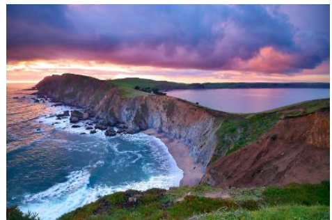
Point Reyes Seashore, Marin County, CA