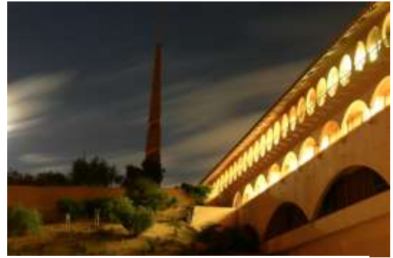
The Marin Center designed by Frank Lloyd Wright

8. Art and Music. Since the 1950s and '60s, Marin has been the home and haunt of many fine artists and musicians. An art colony is centered in the Marinship-houseboat area of Sausalito, the villages of West Marin, and, more recently, in the Hamilton center of Novato. Fine music venues are proliferating in Mill Valley (the Sweetwater Music Hall, 142 Throckmorton Theater), Fairfax (The Sleeping Lady Cafe), and San Rafael (Terrapin Crossroads, George's Nightclub). The Marin Center, and the Marin Civic Auditorium, designed by Frank Lloyd Wright, presents music and dance groups from around the world.