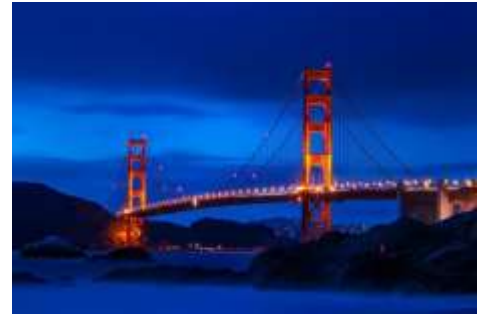
The Golden Gate Bridge from the Marin Headlands

2. Minutes to the Wine Country. From Central Marin, a leisurely drive of 35 minutes takes you to the Sonoma Town Square. Another 30 minutes or so, you will be in Healdsburg and the Alexander Valley or Yountville, Saint Helena, Napa, and Calistoga. If you tire of visiting the hundreds of excellent small wineries, you can relax in the natural hot springs of The Sonoma Mission Inn or the many spa resorts in Calistoga. It is always beautiful in the Sonoma and Napa Valleys, winter through autumn.