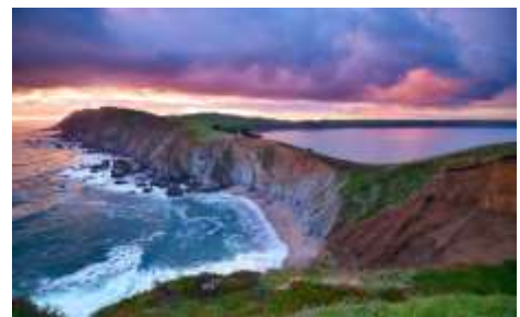
Point Reyes Seashore. Marin County, CA

4. Clean Air. The Bay Area is highly populated, but the air in Marin is the best because of its coastal location and geographic features. Winds and summertime fog coming from the ocean wash the air clean. Because of the protection by Mount Tamalpais, most of Marin is free from the direct effects of the fog.