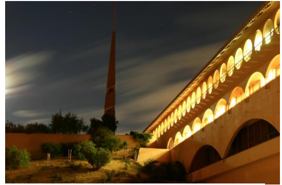
The Marin Center designed by Frank Lloyd Wright

8. Art and Music. Since the 1950s and '60s, Marin has been the home and haunt of many fine artists and musicians. An art colony is centered in the Marinship-houseboat area of Sausalito, the villages of West Marin, and, more recently, in the Hamilton center of Novato. Fine music venues are proliferating in Mill Valley (the Sweetwater Music Hall, 142 Throckmorton Theater), Fairfax (The Sleeping Lady Cafe), and San Rafael (Terrapin Crossroads, George’s Nightclub). The Marin Center, and the Marin Civic Auditorium, designed by Frank Lloyd Wright, presents music and dance groups from around the world.