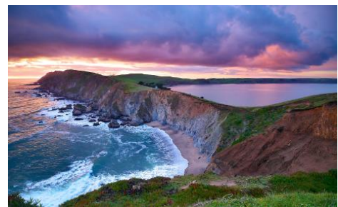
Point Reyes Seashore. Marin County, CA

4. Clean Air. The Bay Area is highly populated, but the air in Marin is the best because of its coastal location and geographic features. Winds and summertime fog coming from the ocean wash the air clean. Because of the protection by Mount Tamalpais, most of Marin is free from the direct effects of the fog.