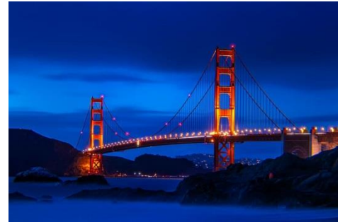
The Golden Gate Bridge from the Marin Headlands

2. Minutes to the Wine Country. From Central Marin, a leisurely drive of 35 minutes takes you to the Sonoma Town Square. Another 30 minutes or so, you will be in Healdsburg and the Alexander Valley or Yountville, Saint Helena, Napa, and Calistoga. If you tire of visiting the hundreds of excellent small wineries, you can relax in the natural hot springs of The Sonoma Mission Inn or the many spa resorts in Calistoga. It is always beautiful in the Sonoma and Napa Valleys, winter through autumn.